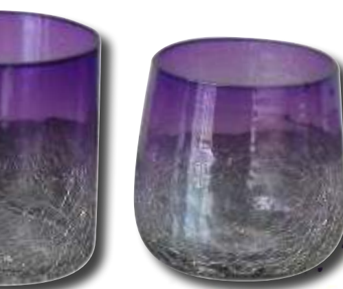
Item no. 1011212