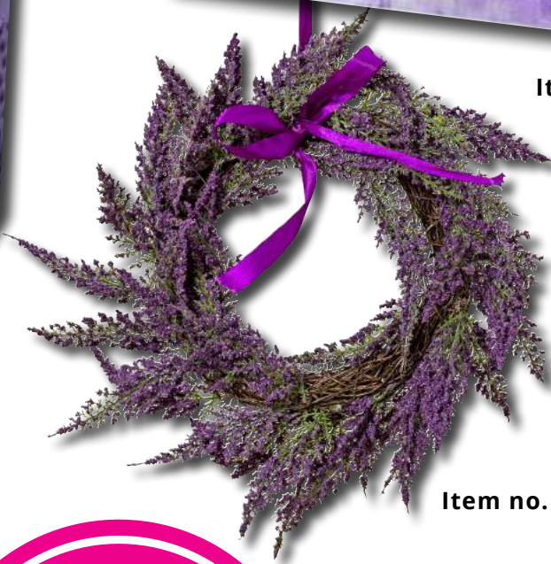
Item no. 1002239