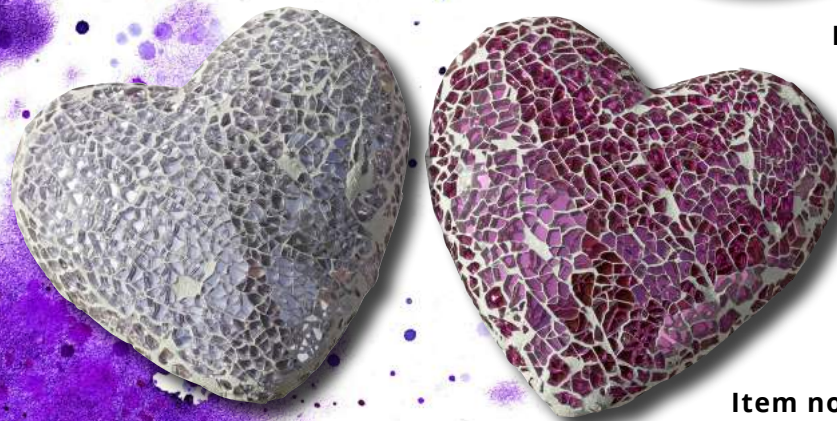
Item no. 1005725