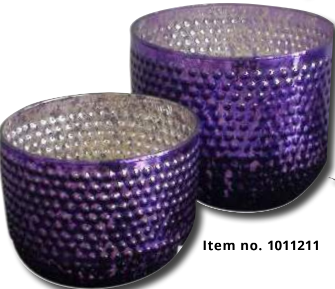
Item no. 1011211