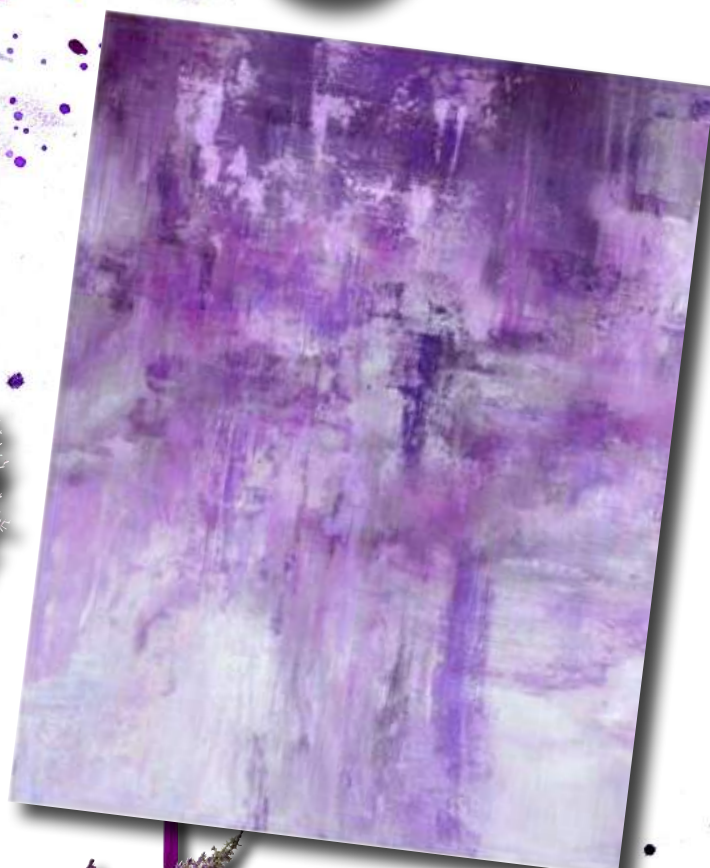
Item no. 1011864