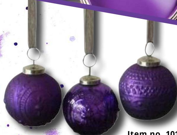
Item no. 1011857