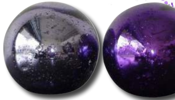
Item no. 1011862